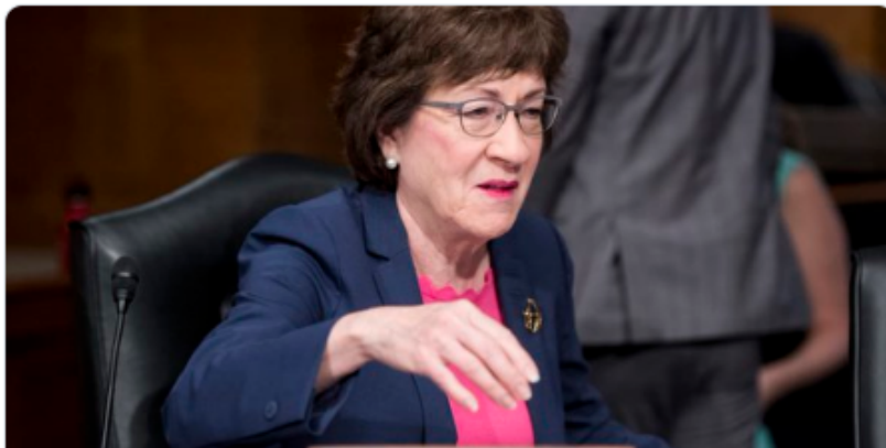
Collins cast deciding vote to let Trump take money from military families for ... Sen. Susan Collins (R-ME) claims she is opposed to Trump stealing money from the military to build a wall, but she doesn't vote that way. shareblue.com

Please, Maine: END her political career.